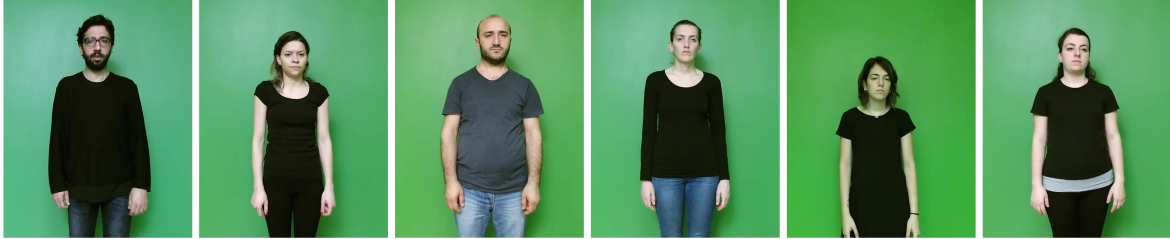
Figure 1: Native signer participants of the BosphorusSign22k dataset. (We propose using the left-most five signers as the training set and keep the remaining for evaluation.)