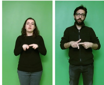
Figure 3: Test sample of INSURANCE sign gloss (left) misclassified as FUND (right).

We further investigated false classifications to gain further insight. For example, INSURANCE, INTERNET and COLD sign glosses are commonly confused with FUND, TEACHING and FACE respectively. Upon investigation we discovered that this is due to baseline methods' inability to model fine grained hand shapes. As seen in Figure 3, while our models were able to distinguish the sign by its motion, it fails to discriminate it using the similar hand-shapes. We believe this is due to the image resolution our networks are trained for in the case of MC3 model and the representation limitations of the HOG features for our IDT baseline. One way to tackle this problem could be to utilize specialized networks, such as Deep Hand proposed by Koller et al. (2016a), and use it as another modality in our recognition pipeline.